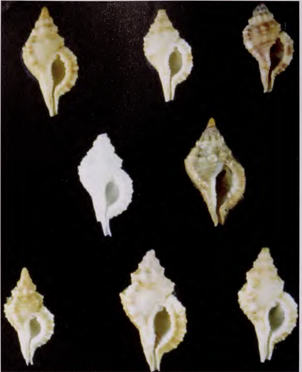
Fig. 4: Paratypes of Cymatium (Monoplex) comptum amphiatlanticum n. ssp