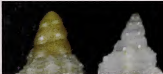
Fig. 2: Comparison between C. comptum amphiatlanticum and C. comptum protoconchs. Note the differences between whorls morphology.