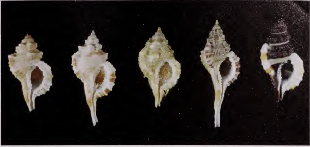
Fig. 5: Comparison between specimens of similar length of some species of the " Cymatium vespaceum Complex". From left to right: n. sp. from MOZAMBIQUE; C. comptum , from PHILIPPINES; C. comptum amphiatlanticum , from FLORIDA; C. vespaceum and Holotype of C. indomelanicum , both from MOZAMBIQUE. Note the differences between whorls, spire, aperture and siphonal channel of each specimen.