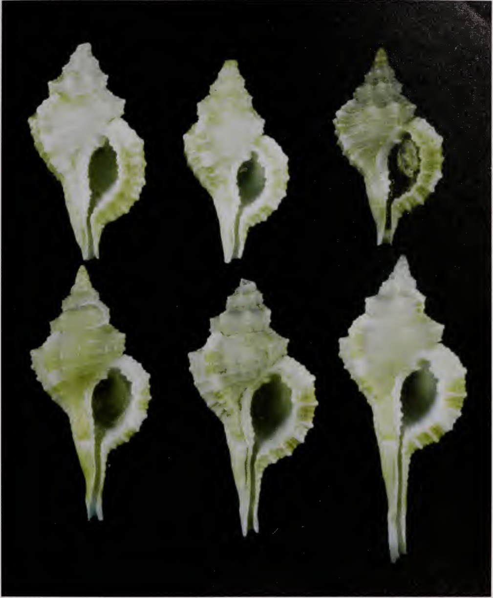
Fig. 3: From left to right side, Paratypes 6 and 7 and Holotype of Cymatium (Monoplex) comptum amphiatlanticum n. ssp. (first row), comparing with three small specimens of the Indo - West Pacific typical form of C. comptum , (second row).