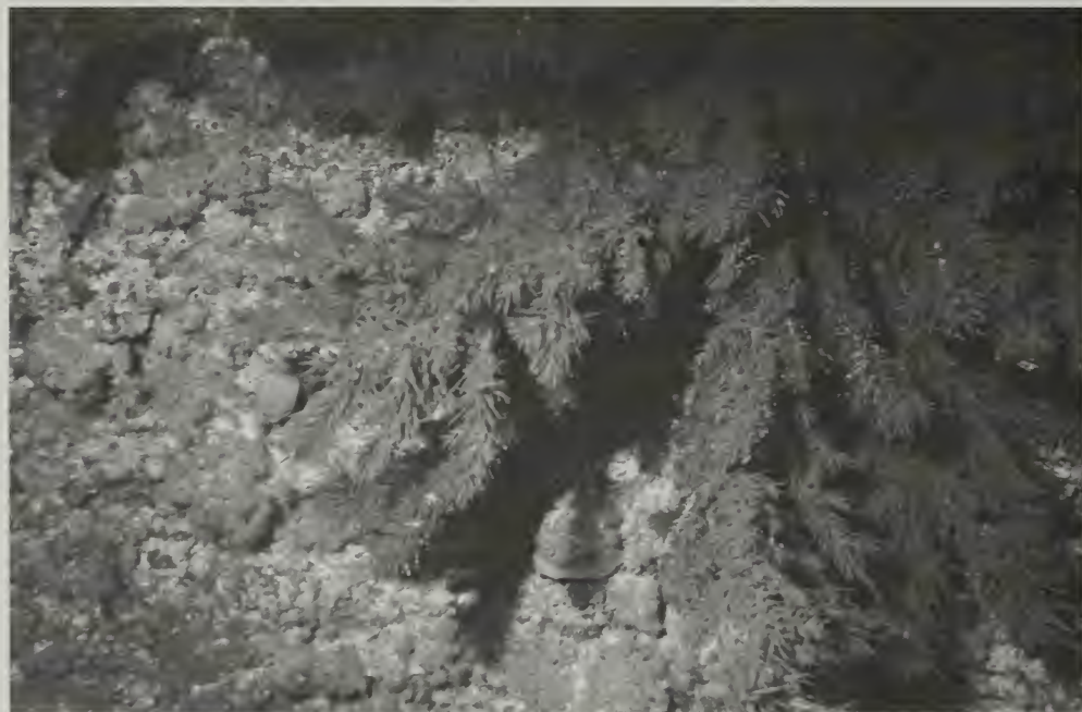
Fig. 7. Habitat of Antipathella wollastoni at Ceuta bottoms.

An examination of the contents of the coelenteron of polyps of the Ceuta specimen revealed the remains of small crustaceans, indicating that the polyps feed on zooplankton.