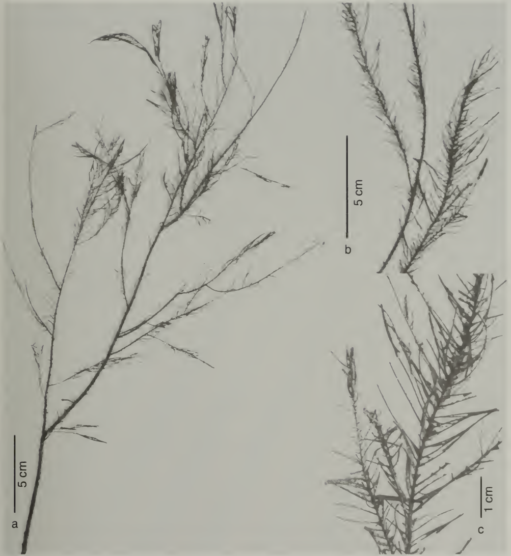
Fig. 5. Corallum, branches and pinnules of the type of A. wollastoni (Gray), BMNH.

in some places. Where they occur on all sides of the branchlets, there are 14 to 25 (mostly 16-19) per centimetre. The pinnules tend to be directed distally, with a distal angle of approximately 60^\circ . A few of the pinnules have one, or rarely two, subpinnules which arise 1-3 mm from the base of the primary pinnule and are directed distally. In some cases the subpinnules may actually represent the earliest forming pinnules on an incipient branch.