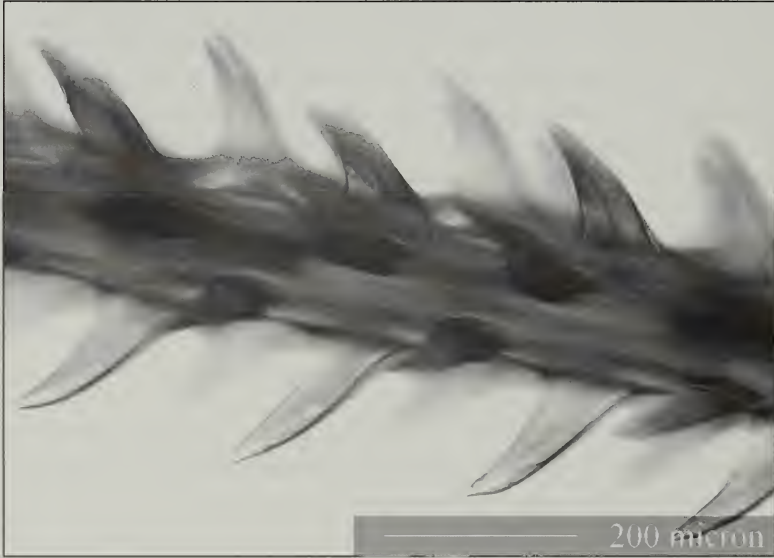
Fig.2. Spines from the pinnules: disposition and size.

Polyps. - The polyps of the Ceuta specimen measure not more than 1 mm in transverse diameter and some may be as small as 0.55 mm. There are commonly 11-12 polyps per centimetre (range 9-13 per centimetre). When alive, they are white in colour and the rest of the colony surface (coenenchyme) is brown.