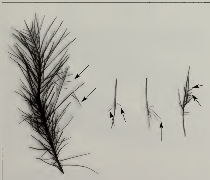
Fig. 1. Pinnules and subpinnules on a branch of the Ceuta specimen.

Corallum .- Densely branched with simple elongate pinnules arranged in several irregular rows (fig. 1). Some of the pinnules are subpinnulate (fig. 1), a feature which was previously reported for specimens from Macaronesia (see BRITO [2]). The pinnules are 0.2 to 4.5 centimetres long, and there are 4-20 pinnules along one centimetre of branch.