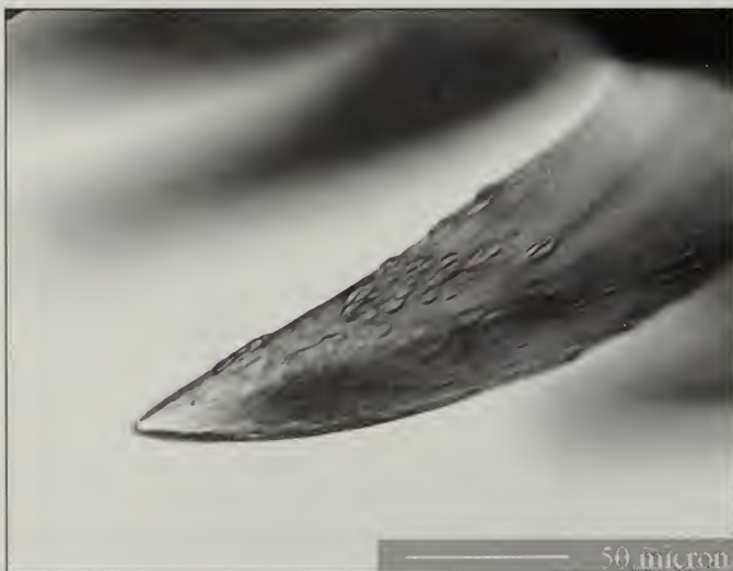
Fig. 3. Single spine showing tubercles.