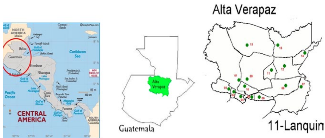
Figure 2. Study Site.