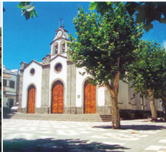
Church of San Vicente Ferrer.