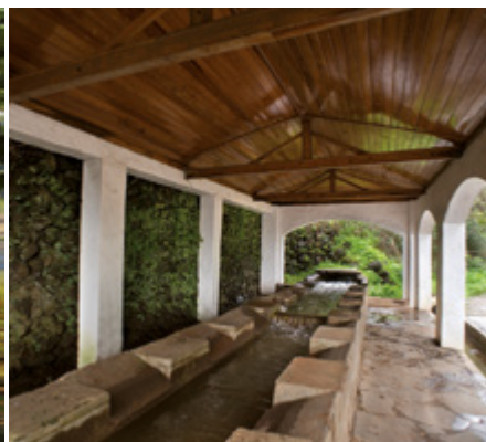
Washing sinks in Valleseco.

an extensive display of Canary flora. It is equipped with barbecues, fresh running water and tables under the shade of chestnut trees, and is ideal for an unforgettable day out in the country. To have a barbecue there it is necessary to call the Town Hall of Valleseco (tel. 928 618 022) and request a permit. No permit is required for just visiting the area. Close by is Pico de Osorio (968m.) a wonderful natural viewpoint where you can make out neighbouring villages and the capital city when you reach the top. Calderetas is another beautiful ancient volcanic basin in which the ochre tones of chestnut trees blend in with poplars, walnut trees