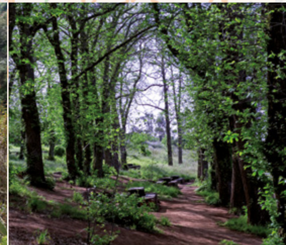
La Laguna de Valleseco.

Before you leave Valleseco, don't forget to taste the first cider of the Canary Islands, made with local reinette apples, as well as other apple products such as vinegar. On Fridays and weekends, next to the museum, you may buy all kind of local produce, freshly-baked bread and handicrafts at Valleseco Ecological Market .