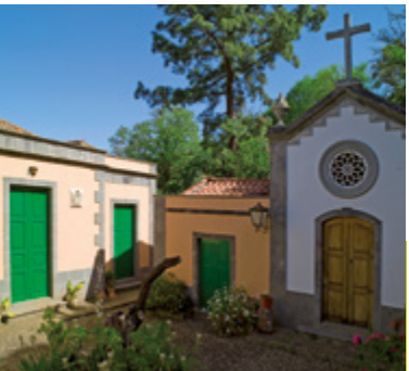
Ermita del Caserón.

The municipality of Valleseco is situated in the interior and to the north of the island of Gran Canaria. This little village, whose land surface area barely covers 22 square kilometres, is just 7 kms. from the neighbouring town of Villa de Teror.