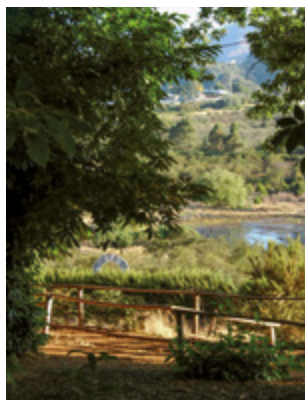
Recreation Area of La Laguna.

Within this Rural Park is the natural enclave known as La Laguna Recreational Area which is home to