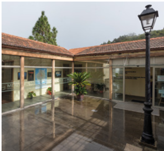
Museo etnográfico de Valleseco.