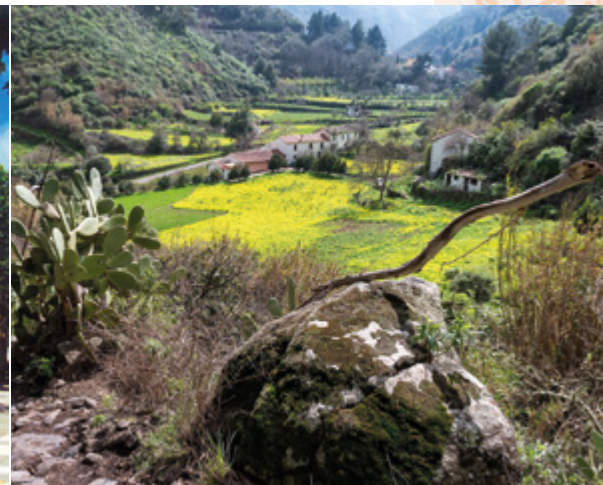
Barranco de La Virgen.