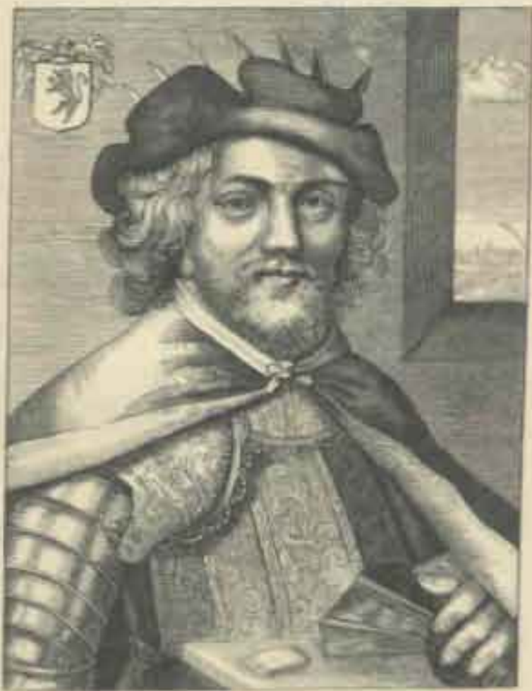
PORTRAIT OF RICHARD, FIRST DU BOURGHOISE, KING OF THE SAXONS