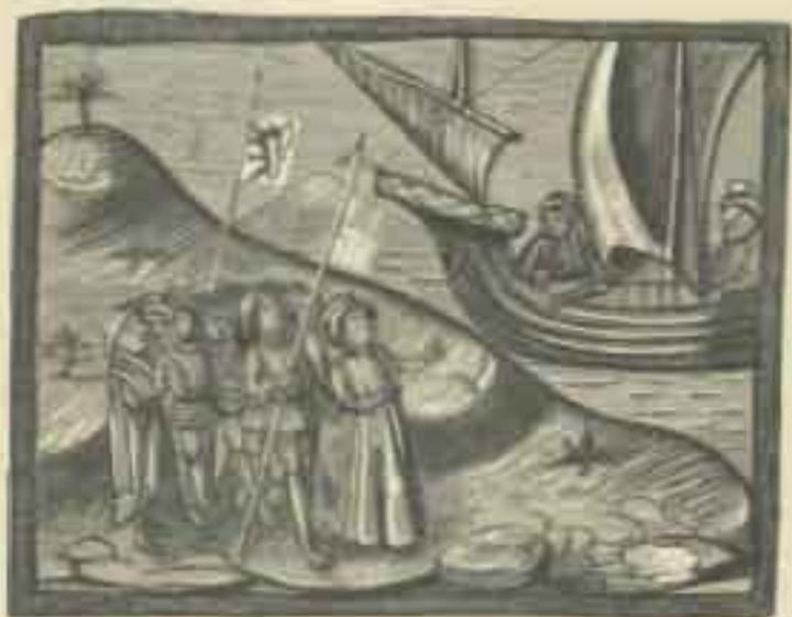
HOW THE MARINEES KEPT THE SAILORS FROM BOARDING THE SHIP.