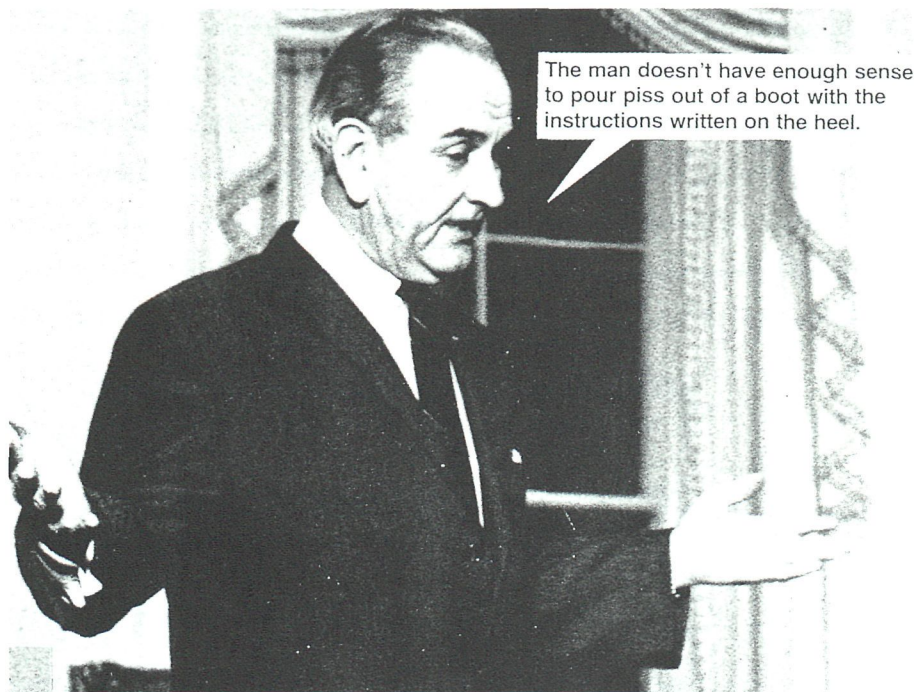
Lutz Bacher. Jokes , 1986.

wrong number” — the Playboys connect up with a different body of Bacher’s work, involving pornography language, in Sex With Strangers (1986) and Men in Love (1990). Taking on the historical relation of Western oil painting to the figure of the female nude, the canvases present the surface of the painting itself as skin, as a surrogate for the female, and perhaps even maternal, body.