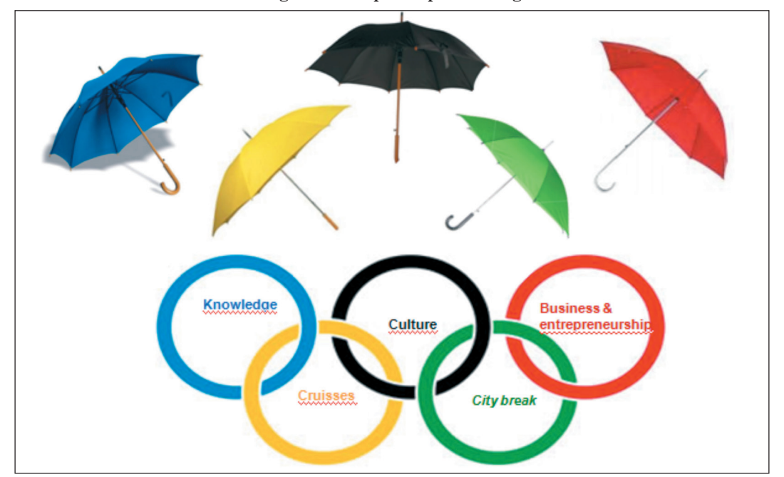
Figure 5: Proposed positioning