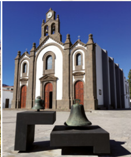
Church of Santa Lucía.