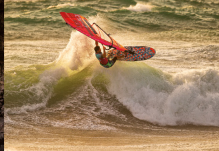
Windsurfing in Pozo Izquierdo.

To round off our trip we must stop off at the Church of Santa Lucía , situated on a hillside of the village and built back in 1905. The structure of its façade is outstanding, beautifully worked in stone and carved out with different historical and religious motifs; and the whiteness and morphology of its dome, which make it visible from miles around.