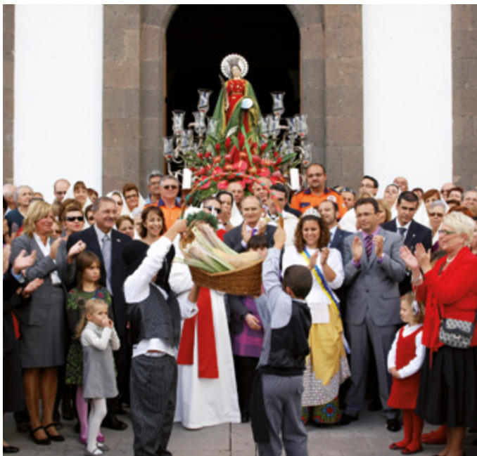
Ofrenda a la Virgen de Santa Lucía.

The 24 th October sees the celebration of the fiesta in honour of San Rafael in Vecindario. It has been declared a local fiesta in the municipality and boasts a superb cattle fair among other attractions.