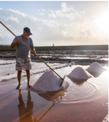
The Salinas at Tenefé.

Situated to the southeast of the island some 680 metres above sea level. 51 kilometres away from the island's capital.