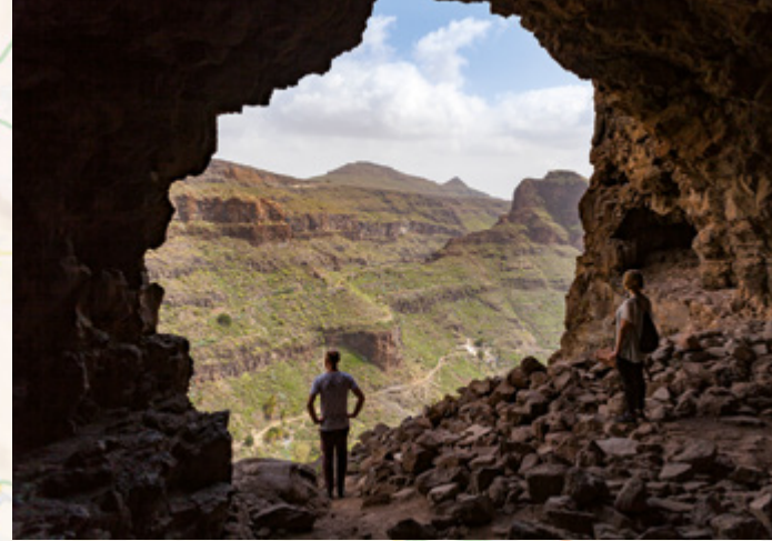
The fortress of Ansite.