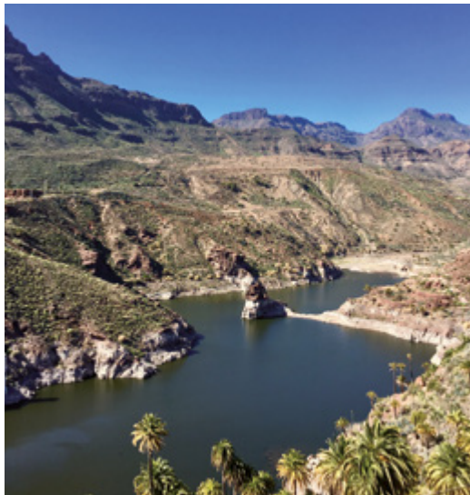
Reservoir la Sorrueda.

As we leave the reservoir once again back to the village of Santa Lucía we come to the Castle Museum of La Fortaleza with its high historical and cultural interest for visitors. It is basically an archaeological site as there is a fine display of remains that were found in the settlements in the surrounding areas.