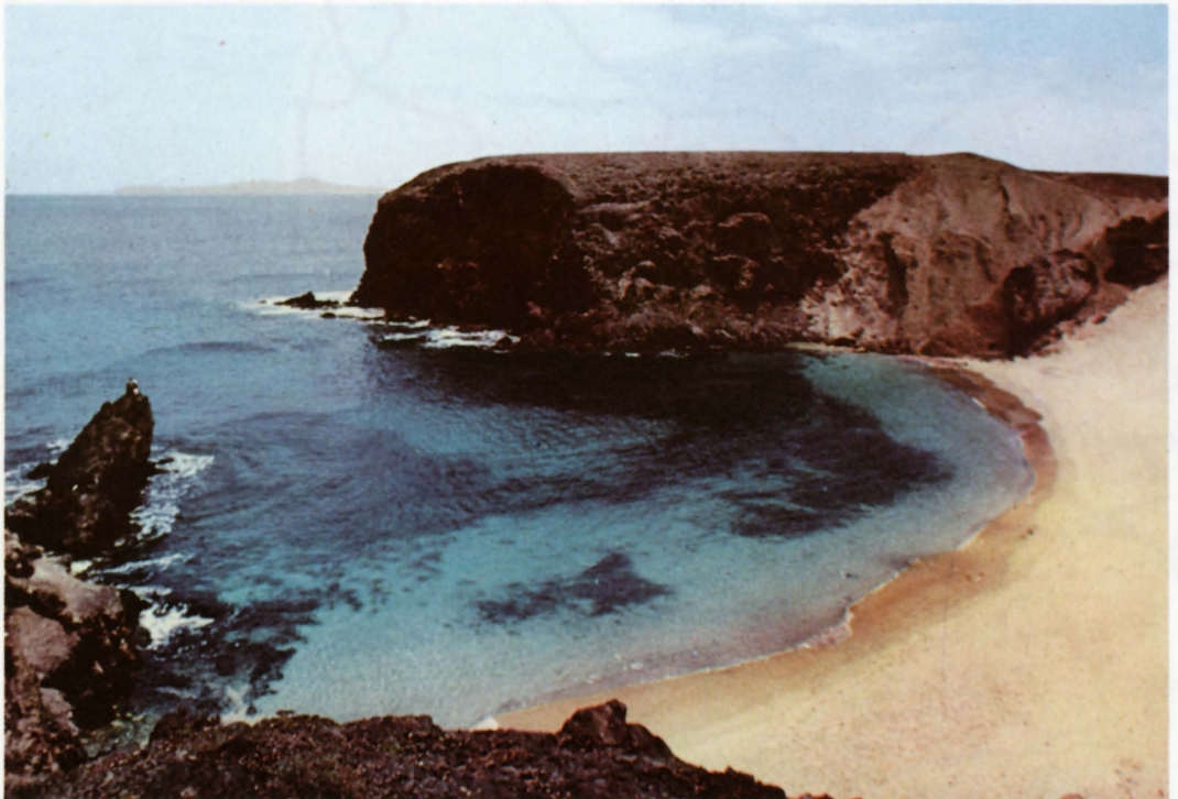
PLAYA DEL PAPAGAYO