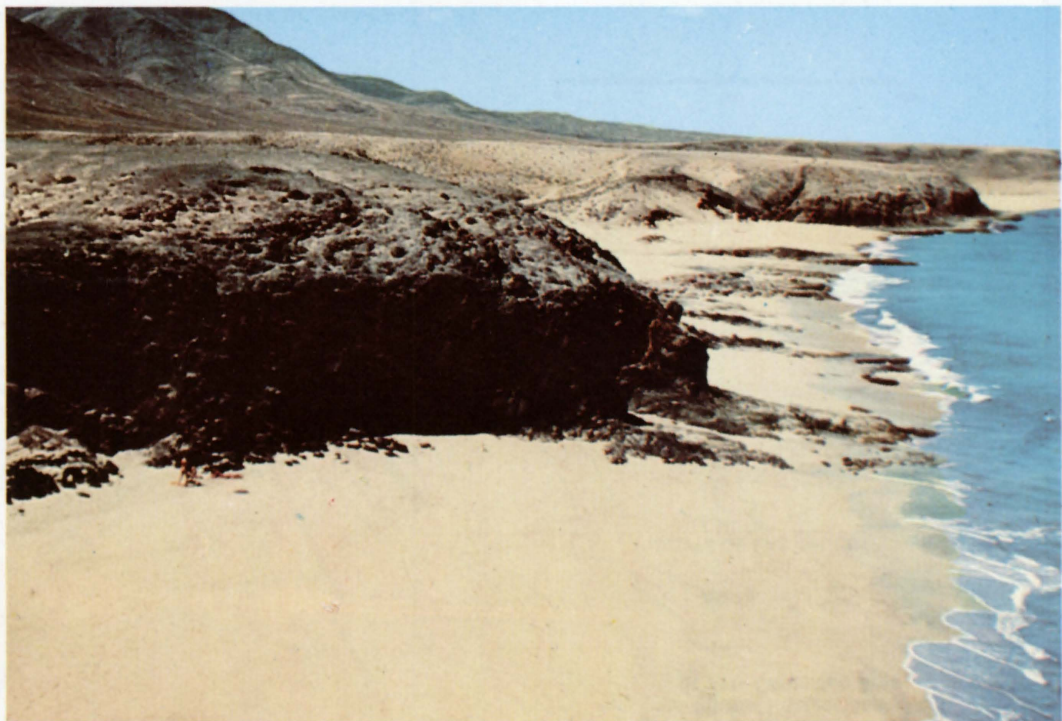
PLAYA DEL PAPAGAYO