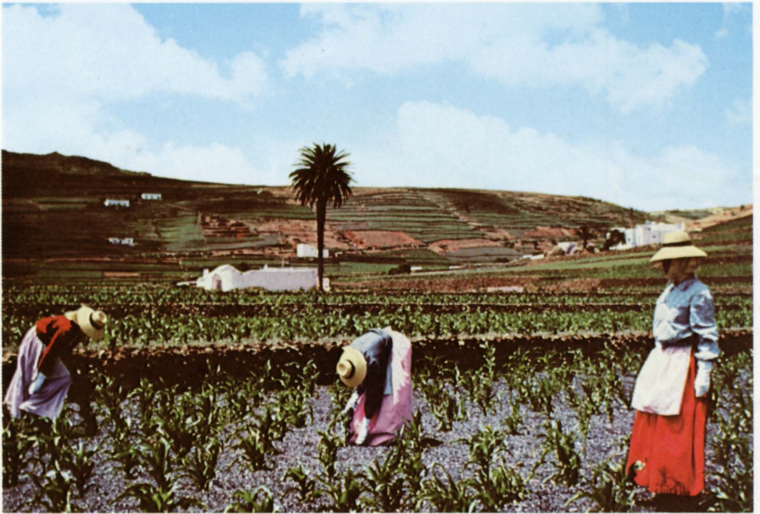
FAENAS DEL CAMPO