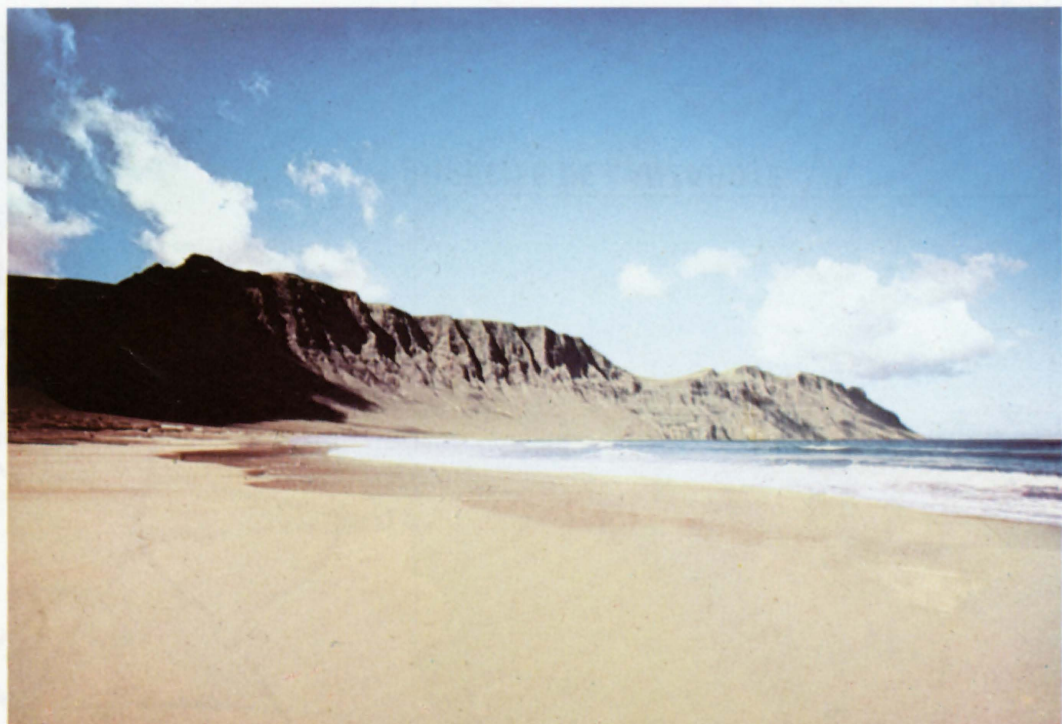
PLAYA DE FAMARA