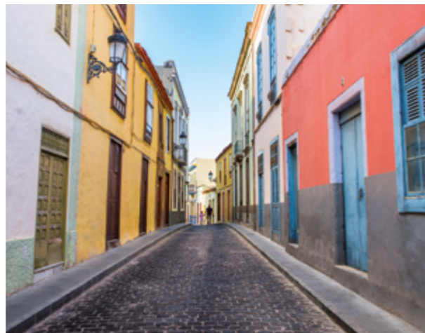
Historic Town Centre.