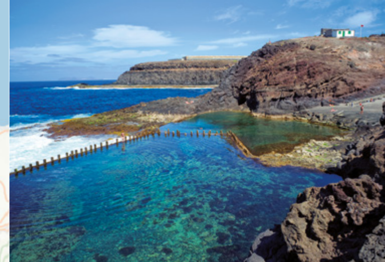
Natural Pools of Roque Prieto.