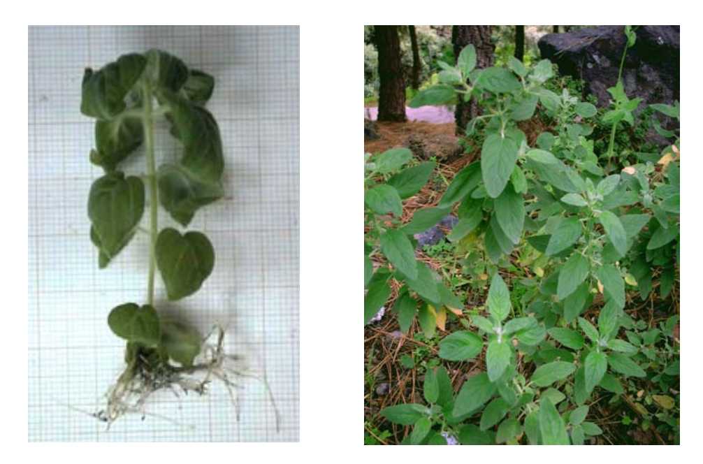
Figure 6. - In vitro rooted plant before transfer to soil (left) and plants growing at the Jardín Canario, one year after their acclimatisation (right).