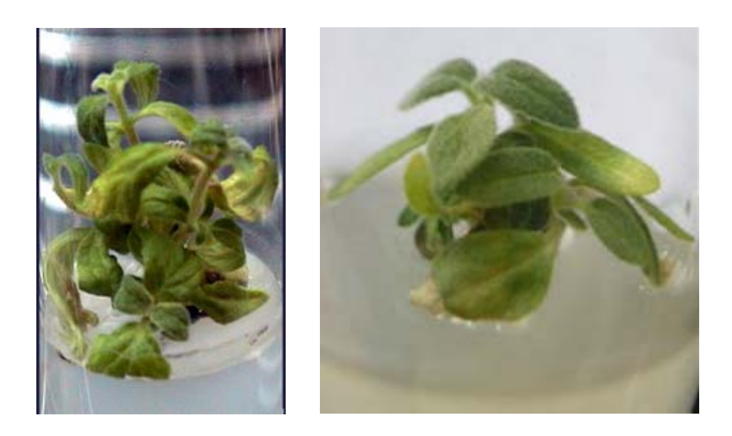
Figure 5. - Shoot multiplication on MS medium supplemented with 1 m/g of BA (left) and 1.5 mg/l of Kint (right).