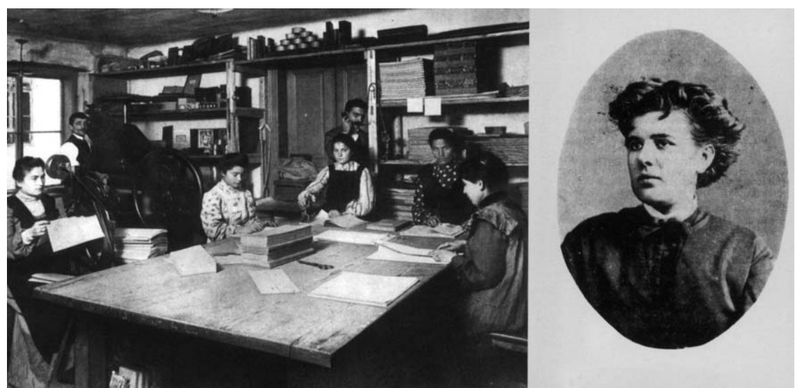
Illustration 3. Art postcard representing quotidian dimension of life and work of Marija Jambrišak, the woman who held a speech demanding equal rights to labour and equal fees for women in Zagreb in 1871.(SOURCE: Gallery Nova Archives).

to take in consideration possibility of marking Female Guide through Zagreb with memorials on the houses and institutions which these exceptional women were attached to during their lifetime. Such memorials on the houses and institutions could be points of departures for alternative touristic routes. It is an excellent proposition for change in architexture and creating a new path for conquest in conviviality and knowledge. The project was supported by printing art postcards with additional educational value bonus (illustration 3).