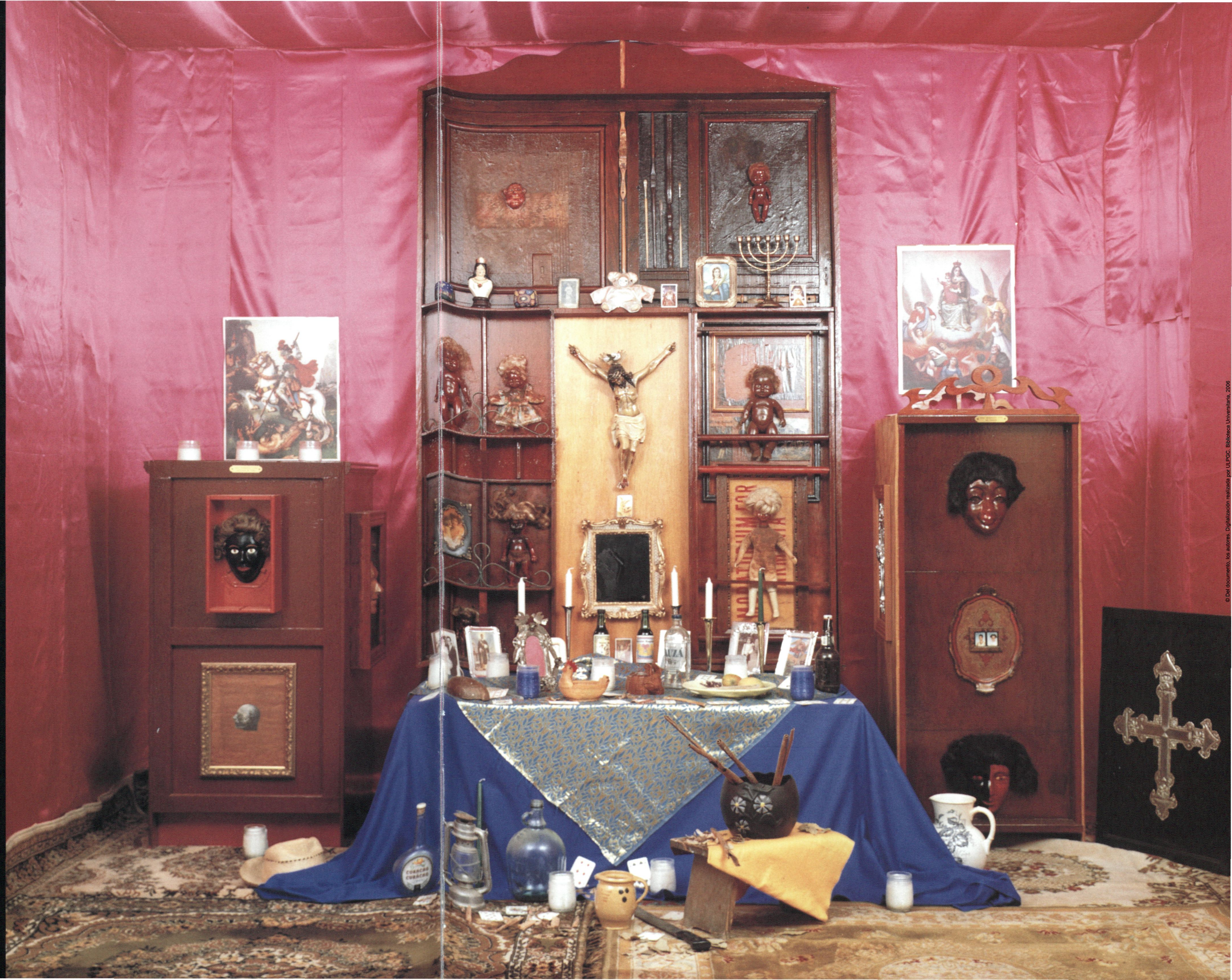
TONY MONSANTO. Altar Changó/Tula, 2002. Instalación, técnica mixta | Installation, mixed media, 360 x 270 x 200 cm.