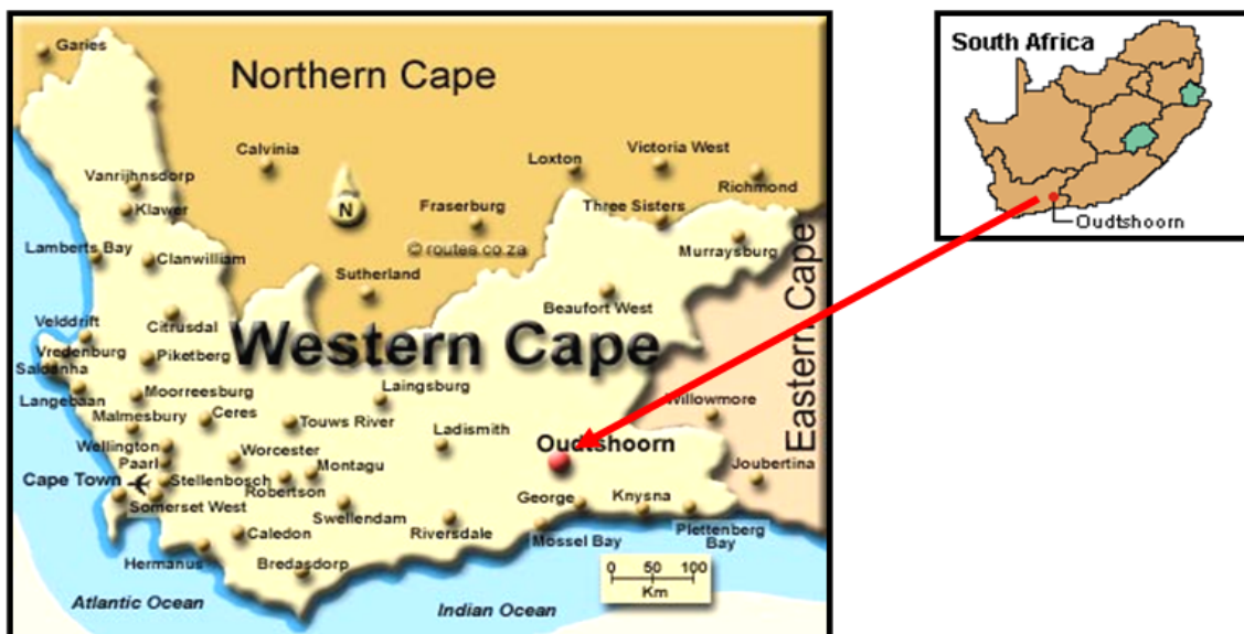
Map 1: Western Cape Province, Oudtshoorn

In order to maximise the growth and provide quality services to entrepreneurs at the KKNK, festival organisers should have a greater understanding of the role and attributes of entrepreneurs. The purpose of this article is to explore the attributes and role of entrepreneurs at the KKNK Festival.