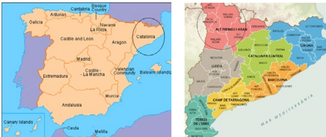
Figure 1: Geographic area