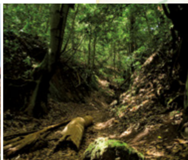
Finca de Osorio.

The historic town centre of Teror constitutes one of the most important cultural heritage sites in the Canaries, with a deep-rooted religious and social identity that impregnates every street, house, square and monument of the town. In April 1979, the area surrounding the Basilica was declared a Historic-Artistic Town.