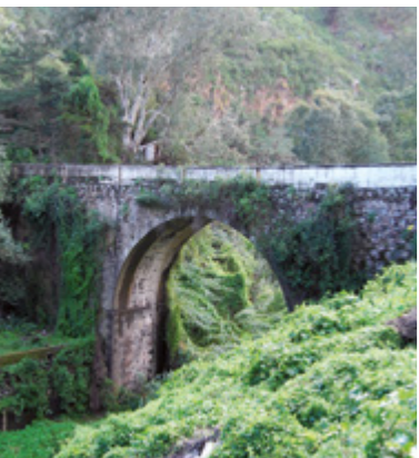
Puente del Molino.

The municipality of Teror is situated on the northern hills of the island of Gran Canaria, with some 20 km separating the Town Centre of Teror from Las Palmas de Gran Canaria.