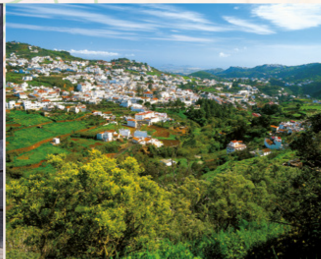
Teror Town Centre.