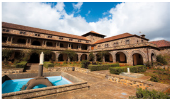
Monasterio de Las Dominicas.

The oldest bridge in Gran Canaria is carefully preserved here in Teror. The Puente del Molino was built between 1824 and 1828 to join the capital with the Villa de Teror, across the Pino Ravine, although since 2010 Teror now has a viaduct which provides a short cut to the town. The original Puente de Molino is still used by thousands of cars throughout the year, both for its value as a historical attraction as well as for the beautiful landscapes which can be seen from the bridge itself.