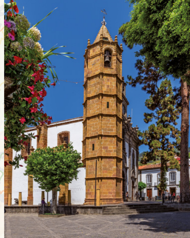
Basilica of El Pino.

Services 216 and 229 leaving every 30 minutes.