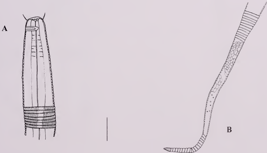
Figure 1.- Actinonema sp. Juvenil. A. Anterior end. B. Posterior end. Scale A = 15 \mu\text{m} , B = 20 \mu\text{m} .