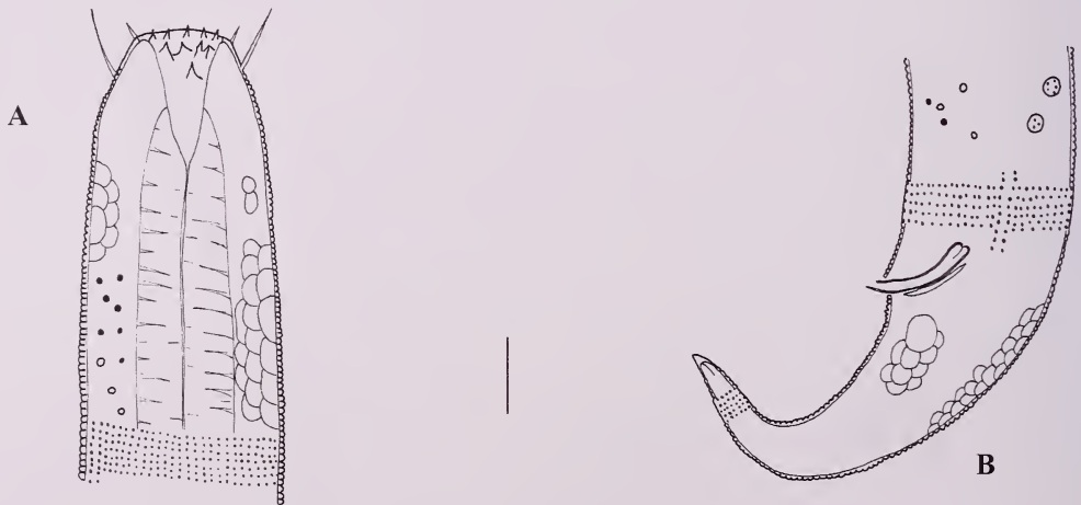
Figure 2.- Hypodontolaimus sp. Male. A. Anterior end. B. Posterior end. Scale A = 20 \mu\text{m} , B = 15 \mu\text{m} .