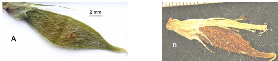
Figure 3. Vicia chaetocalyx . A. legume and calyx of a collected plant near Valleseco on 02-27-2001. B. legume from the holotype near Telde.