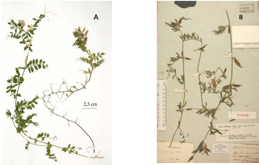
Figure 1. Vicia chaetocalyx . A. Specimen of Vicia chaetocalyx from Valleseco at about 1300 m above sea level (leg. 02-27-2001). B. Holotype at the Herbarium Webbianum (FI-W).