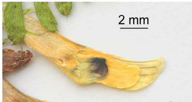
Figure 2. Vicia chaetocalyx . Flower with purple spotted keel (parts of one wing are removed)