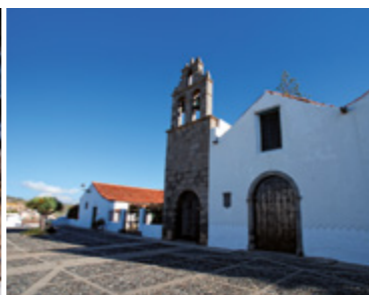
Artistic Historic District of San Francisco.

out of corn cob paste, as well as the 16 th century Gothic Flemish Alterpiece .