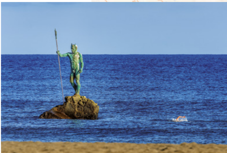
El Neptuno, Melenara Beach.