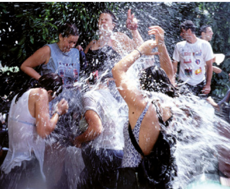
Fiesta de La Traída del Agua.