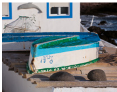
Barcas en Tufia.

We then move on to the town's founder site of San Juan , the present day administrative and judicial centre in the municipality. This borough with its stately town houses makes our stroll a highly gratifying one thanks to the wealth and variety of the architecture of the houses and other buildings on show, that combine a simple Mudejar style together with the other styles. We propose you spend just a little time at the Alameda and Basilica of San Juan Bautista , where you will find a wide variety of works of art, namely the Santísimo Cristo de Telde on the main altar, originally from Mexico and made